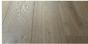
Pismo Oak AV750PIS