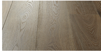
Ojai Oak AV750OJA