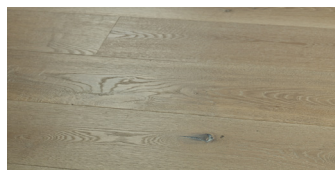
Balboa Oak AV750BAL