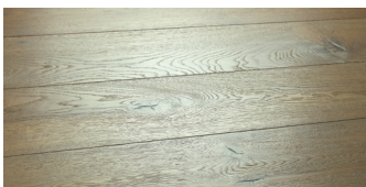
Malibu Oak AV750MAL