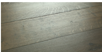
Del Mar Oak AV750DEL