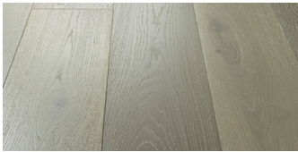
La Jolla Oak AV750LAJ