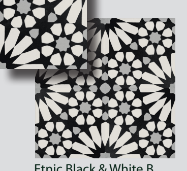
Etnic Black & White B