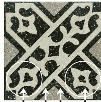
Fleur-de-lis with heart Continuous Line Fleur-de-lis with teardrop Broken Line

The Palazzo Decos require four pieces. Care should be taken during installation to make sure the tiles are correctly placed to achieve the desired final look.