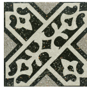
Palazzo Nicola NRPO/99N

The Palazzo Decos require four pieces. Care should be taken during installation to make sure the tiles are correctly placed to achieve the desired final look.