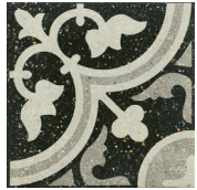
Palazzo Piero NRPO/99P