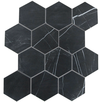
4" Hex GIMABKN/4HX (full sheet shown)