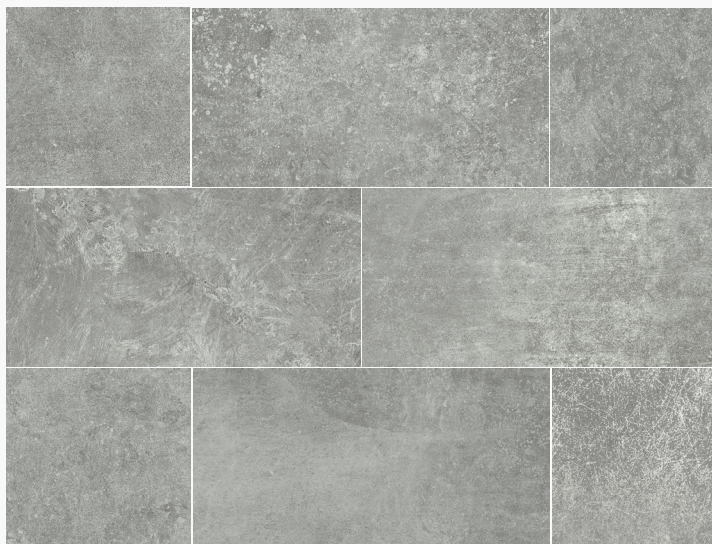
Argento Grey (LOCMAG)