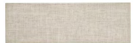
Sisal Haze ANTHFISIH* 4"x12" Coverage: 0.323 sqft/pc *sold by the box