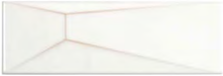
Manhattan Cloud ANTHFIMC 4"x12" Coverage: 0.323 sqft/pc *sold by the box