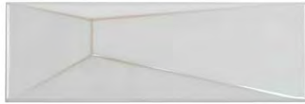
Manhattan Dove ANTHFIMD 4"x12" Coverage: 0.323 sqft/pc *sold by the box