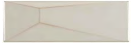
Manhattan Haze ANTHFIMH 4"x12" Coverage: 0.323 sqft/pc *sold by the box