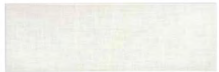
Sisal Cloud ANTHFISIC* 4"x12" Coverage: 0.323 sqft/pc *sold by the box