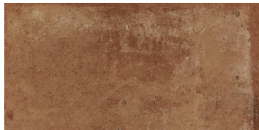
6 x 12