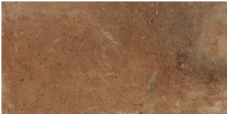
16 x 32