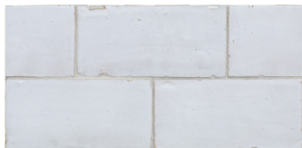
ZELLIGE Puro Blanco