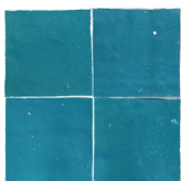
4" x 4"