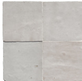
4" x 4"