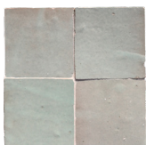
4" x 4"