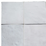
4" x 4"